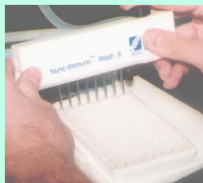
Strip Plate Wash option