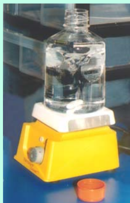
Prepare wash buffer and grain extraction solutions

Borate-Tween: Prepare 0.1 M sodium tetraborate/0.5% Tween 20 (38.1 grams per liter of de-ionized water plus 5 mL Tween 20). Adjust pH to 7.5. Store refrigerated when not in use; allow to come to room temperature prior to assay.