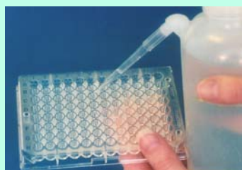
Bottle Wash method