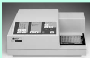
Read plates in a Plate Reader within 30 minutes of the addition of Stop Solution