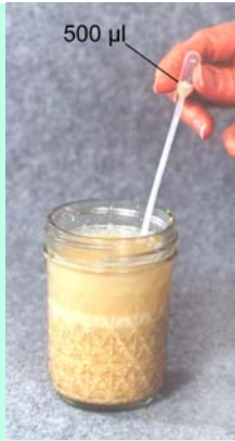
Avoid pulling up particles when drawing sample