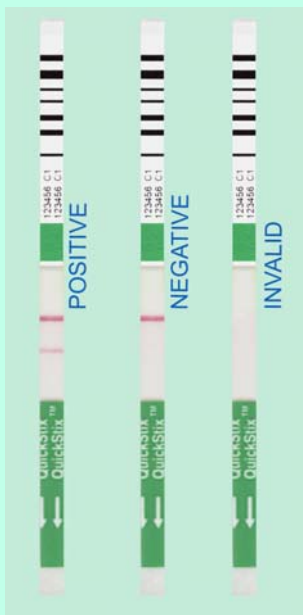
Any clearly discernable pink Test Line is considered positive