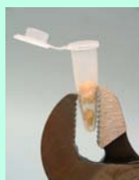
Crush single seed