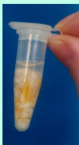
Extract seed sample