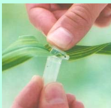
Obtain Leaf Tissue

To prepare the Bulk Extraction Buffer, dissolve one package of Buffer Salts and 2.5 mL of Surfactant into 1 liter of distilled or deionized water and mix until dissolved.