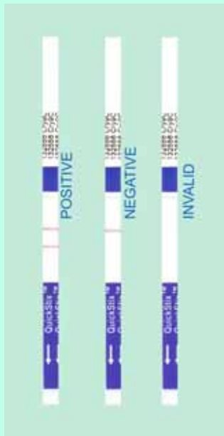
Any clearly discernable pink Test Line is considered positive