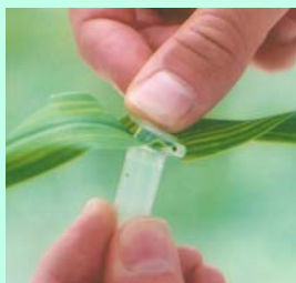
Obtain Leaf Tissue