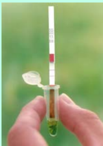
Insert QuickStix Strip