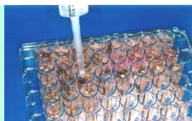
Add Extraction Buffer