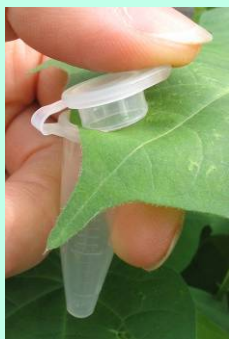
Obtain Leaf Tissue

Contact Envilab to order bulk-packaged kits. Bulk kits include EB2 Extraction Buffer Concentrate. To prepare 1 liter, mix 50 mL 20x Concentrate with 950 mL of distilled or deionized water. Store refrigerated when not in use; allow to come to room temperature before using.