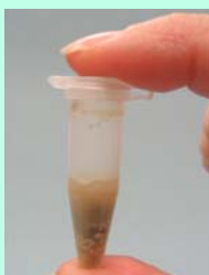
Extract Seed Sample