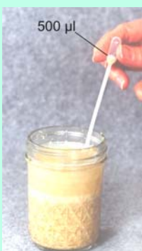
Avoid pulling up particles when drawing sample

\text{Sub-sample weight (g)} \times 1.5 = \text{volume of water (mL)}