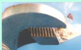
Crush single seed