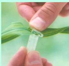
Obtain Leaf Tissue

To prepare the Extraction Buffer, dissolve one package of Buffer Salts and 2.5 mL of Surfactant into 1 liter of distilled or deionized water and mix until dissolved.