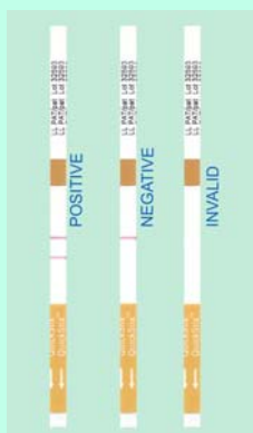
Any pink Test Line is considered positive

Alternatively, remove the dropper tip from the bottle, or use prepared Extraction Buffer made from Buffer Salts, and dispense 0.5 mL (500 microliters) into each tube using a pipette.