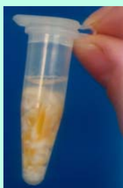
Extract seed sample