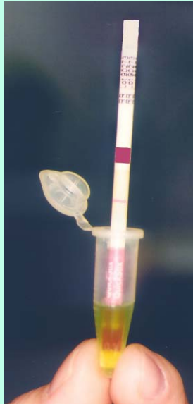
Insert QuickStix Strip