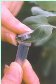
Obtain Leaf Tissue

Contact Envilab to order bulk-packaged kits. Bulk kits include Buffer Salt Packs instead of liquid Extraction Buffer. To prepare, dissolve one package of Buffer Salts and 2.5 mL of Surfactant into 1 liter of distilled or deionized water and mix until dissolved.